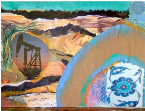
"Desert Gold" Collage (25x17cm)