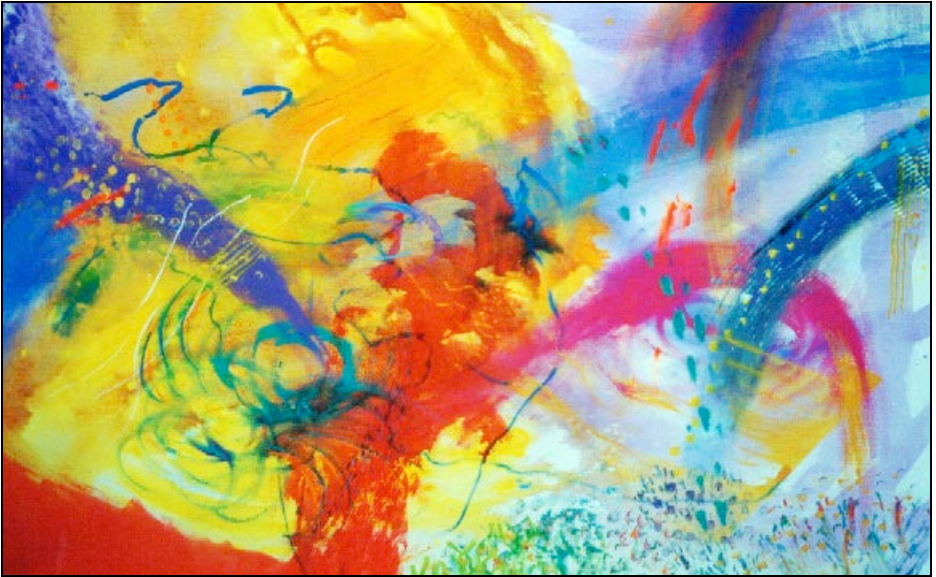
"Celebration" Acrylic on Canvas (116x89cm)