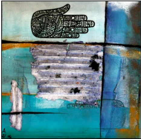
"Fatima's hands 2"