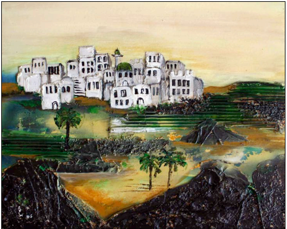
"Village At The Sea" Mixed Media (60x50cm)