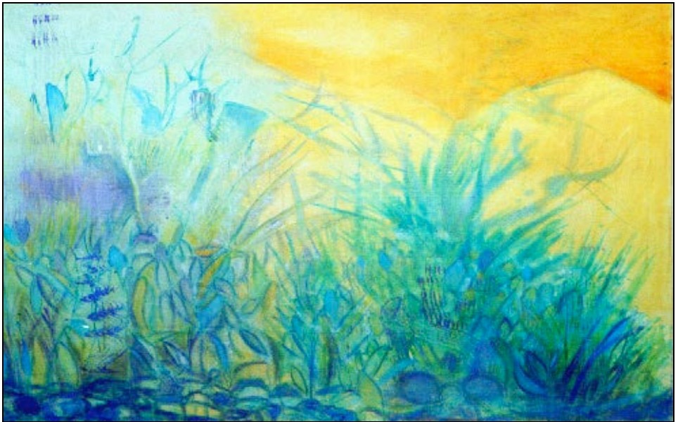
"Winter Desert" Acrylic on canvas (116x89cm)