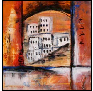
"Doorway View 2"