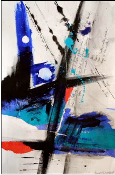
"Between The Moons" Collage (30x40cm)