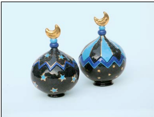
"Arabian Influence 6 & 7"