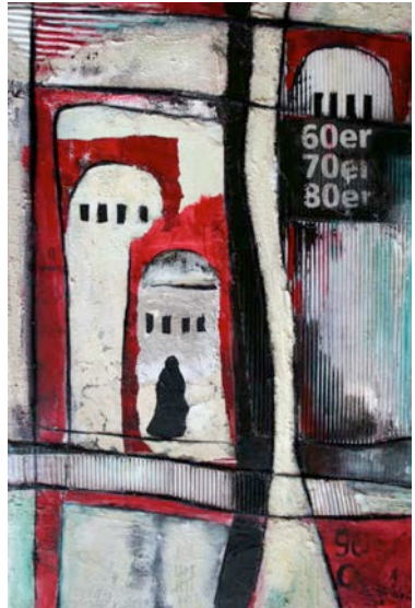
"Passage Of Time" (60x90cm)