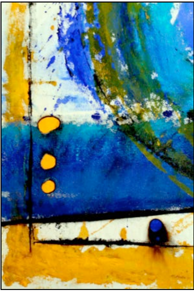
"Water, Three Lonely Lights" Mixed Media (35x45cm)