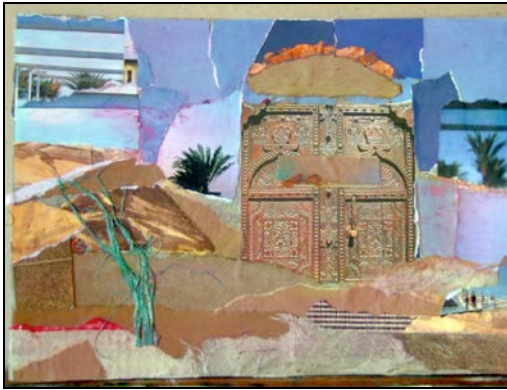
"Gateway To Paradise" Collage (25x17cm)