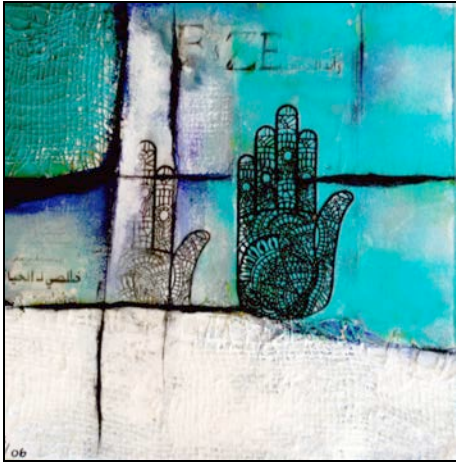
"Fatima's Hands 1"