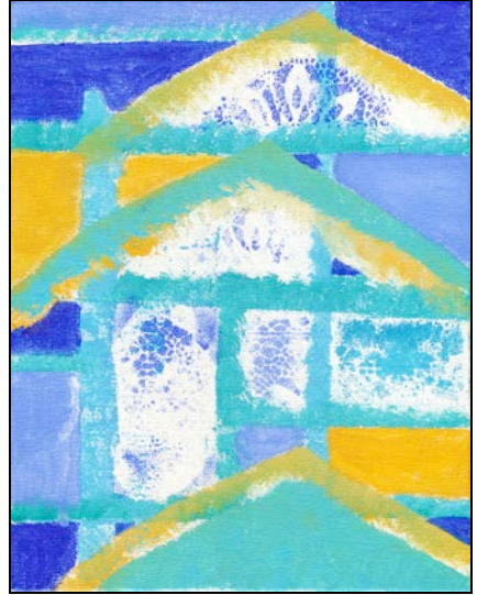
"Arches 3" Acrylic (20x26cm)