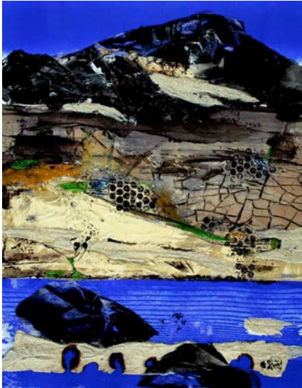
Mountain, Desert, Sea