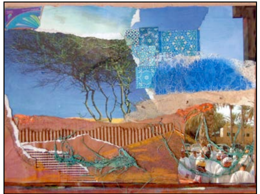
"Nizwa" Collage (25x17cm)