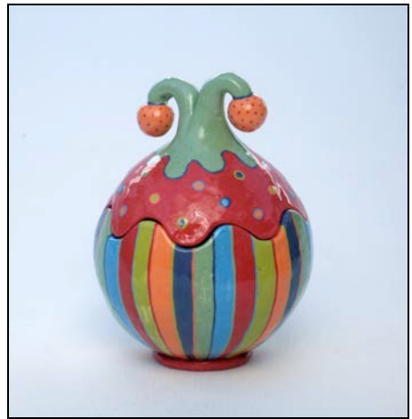
"Fresh And Fruity"