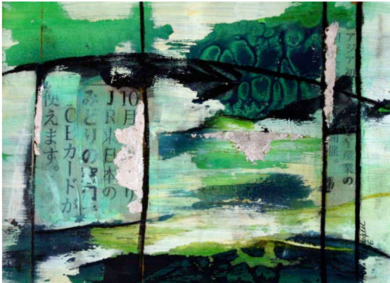
"Take Me There" Mixed media (30x40cm)