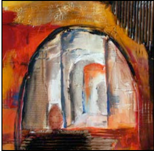
"Doorway in the Souq"