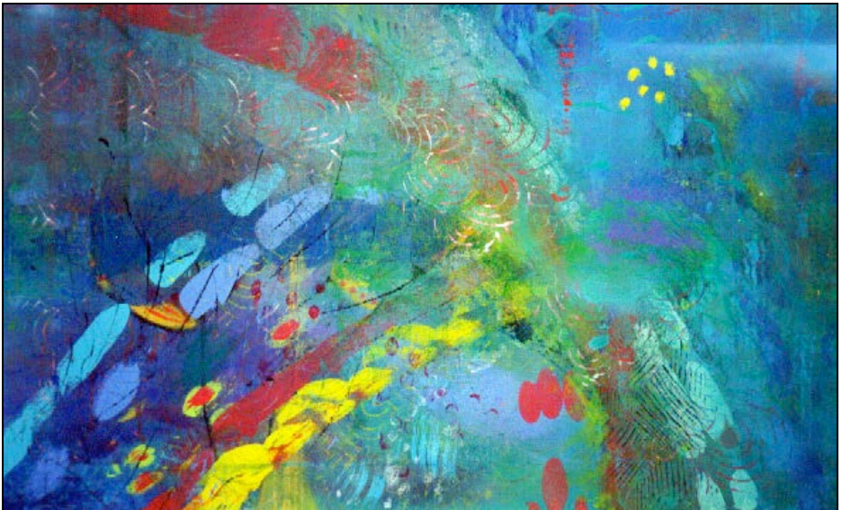
"Giverny" Acrylic on canvas (75x60cm)